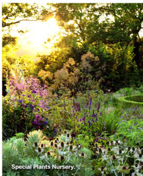
Special Plants Nursery.